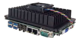
IB918 heatsink with fan